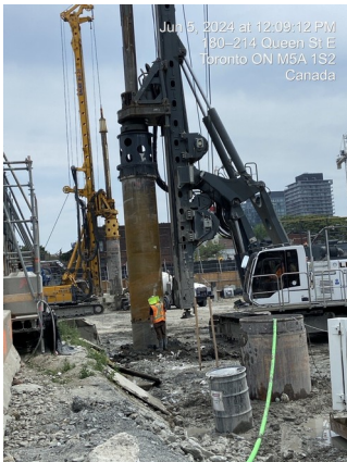
Drilling Operation done using BG36 and LB28

The project included a total of 408 piles, consisting of both filler piles and secondary structural piles. The filler piles had a combined length of 4,141 linear meters with a diameter of 1,180 mm. The structural piles comprised 1,315.38 meters of section W690x265 and 462 meters of section W690x217. Additionally, the project incorporated three levels of bracing work.