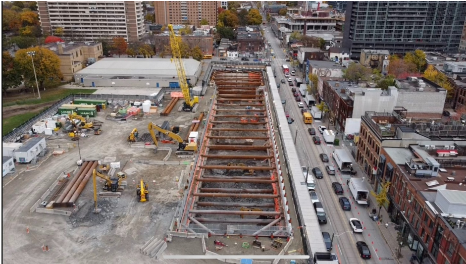
Moss park station after stating of the Bracing